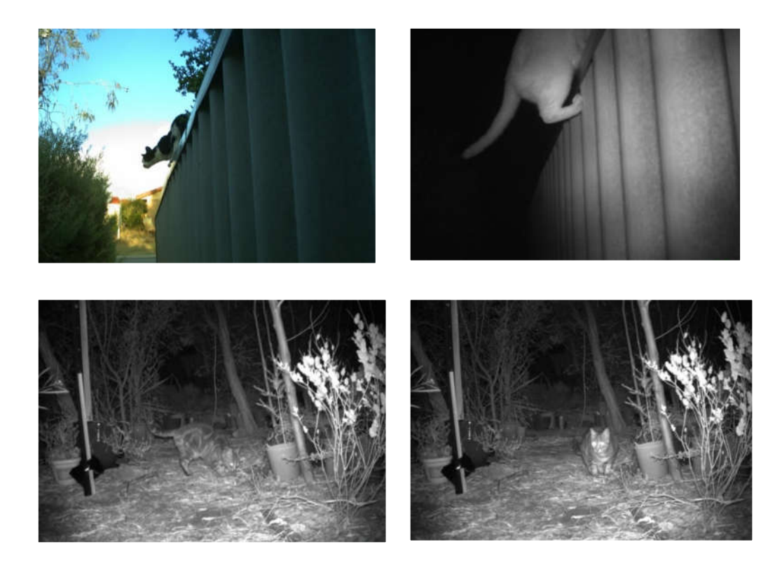
Figure 2. Evidence that free-roaming cats engage in nuisance activity on private properties. Top left and right: Two stray cats enter and exit the front yard of a private property by climbing over a boundary-fence. Bottom left and right: A stray cat defecates on a garden path in a suburban backyard. (in Western Australia, stray cats are any cat without a collar, etc. [192]).