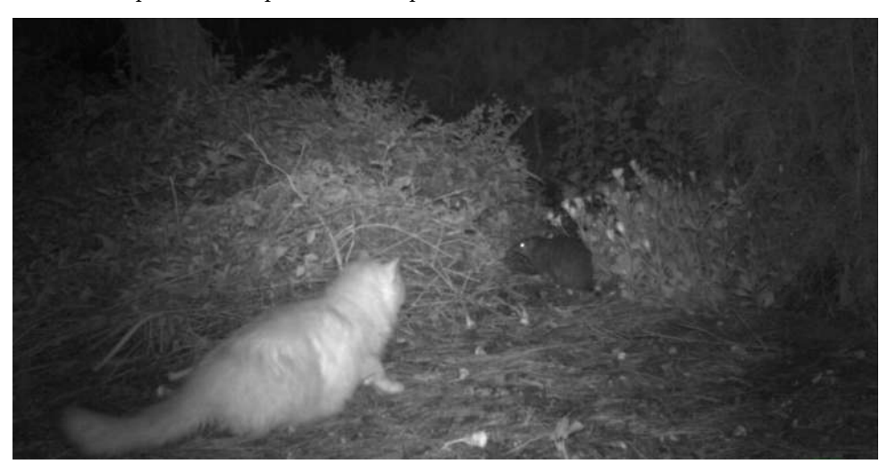
Figure 4. Evidence of cats conflicting with wildlife: a stray cat (in Western Australia, any cat without a collar, etc. [192]) stalking a quenda, an endemic species of bandicoot ( Isoodon fusciventer ) in an urban bushland reserve.

Australian cities contain more threatened animal species per unit area than non-urban areas [221]. For example, Bryant et al. [222] documented the persistence of native quenda ( Isoodon fusciventer , an endemic species of bandicoot) living in Mandurah, Western Australia; however, roaming cats stalk and kill quenda ([191,219] Figure 4). Another study showed that a single, well-fed pet cat drove the local extirpation of a Ctenotus sp. lizard population [223]. Minimizing further anthropogenic impacts on wildlife populations persisting in urban areas includes introducing measures that reduce predation by stray and pet cats. Various predation deterrent strategies have been trialed (e.g., bells [224,225], pounce protectors [217,225], auditory deterrents [191,226,227], curfews [228,229], buffers [230]) with mixed success. In Australia, the impact that even small TNR colonies could have on endemic or range-restricted fauna therefore cannot be discounted. Trials of TNR to determine predation impact on these species should not be risked.