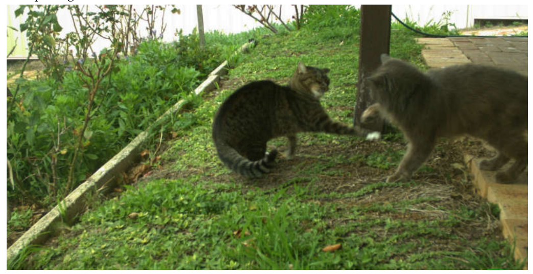
Figure 3. Evidence of cats conflicting with pet cats: a stray cat (any cat without a collar, etc., [192] in Western Australia) interacting with a pet cat in its owners' backyard (pet cat on left).

Stray cats encroaching into private backyards can intimidate, steal food or fight pet cats in their home range [1] (Figure 3). Colonies attract other cats, including pets (e.g., [43]). In both situations, and regardless of neuter status, fighting and disease transmission can result. The mouths and claws of cats contain myriad pathogens that can compromise the health of fight-victims [203,204]. In Sydney, Australia, the prevalence of FIV in 48 colony cats and 20 TNR cats was 21% and 25% respectively [17]; higher than the 16% prevalence in 169 pet cats with access to the outdoors. In Perth, Western Australia, a study of 418 fecal samples from cats, pets had four times lower prevalence of gastrointestinal parasites compared with refuge cats and kittens (2% vs. 8% [205]). The degree of contact that cats had with other cats (and dogs) significantly influenced the prevalence of parasitic infection [205]. Therefore, even if pet cats are regularly vaccinated and dewormed, TNR may increase urban cat densities overall and increase the likelihood of cats fighting and being exposed to common or novel pathogens.