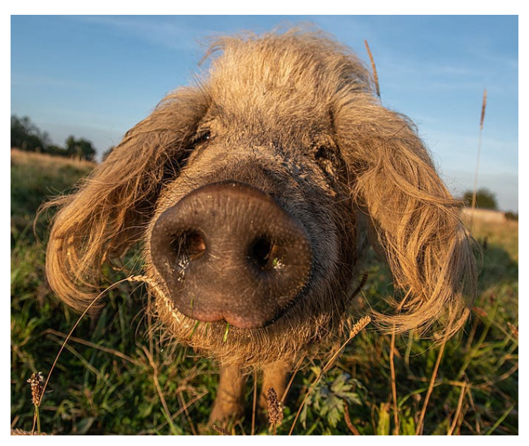
Each one of the billions of farmed animals is an individual. This one's name is Bouloche, he's French, and he has unusually scraggly ears.