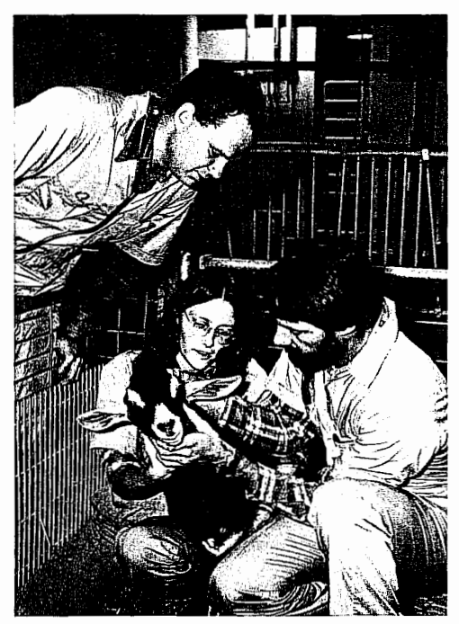
Figure 3. The use of a wide range of species during teaching is important.