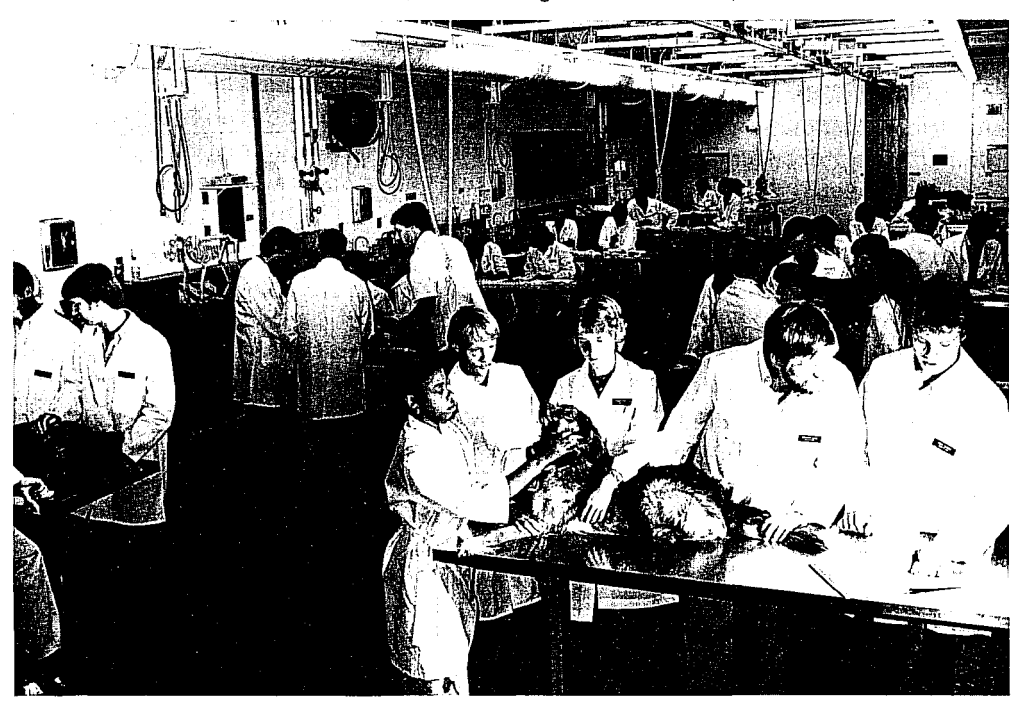
Figure 1. Phase I students during anatomy class. Working with living animals is not only relevant to teaching in clinical medicine, but also instills concern for animals and promotes proper handling and care.