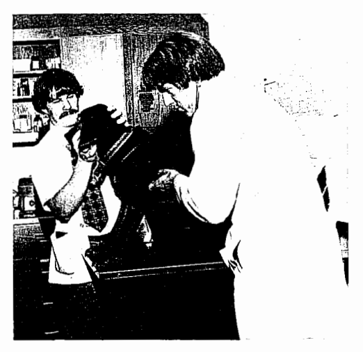
Figure 4. Students giving preoperative care to their teaching dog. Students must be responsible for both pre- and postoperative care of animals.

duction, or other aspects of this society goes beyond the basic concept of rights. Rather, I feel that we have a moral responsibility toward animals, and that I have made a substantial commitment to this responsibility.